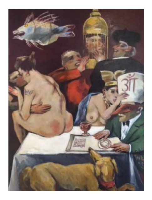
Stanislaw Frenkiel, Incantations , 1993, oil on canvas, Private Collection